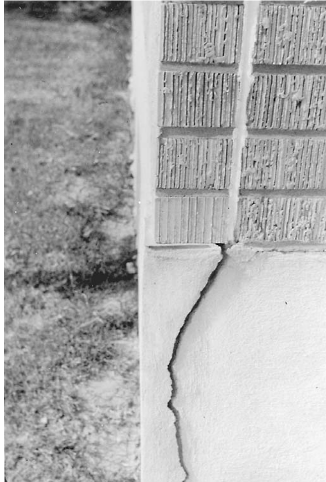
Figure 9-20 Brick expansion forces may exceed tensile strength of concrete.